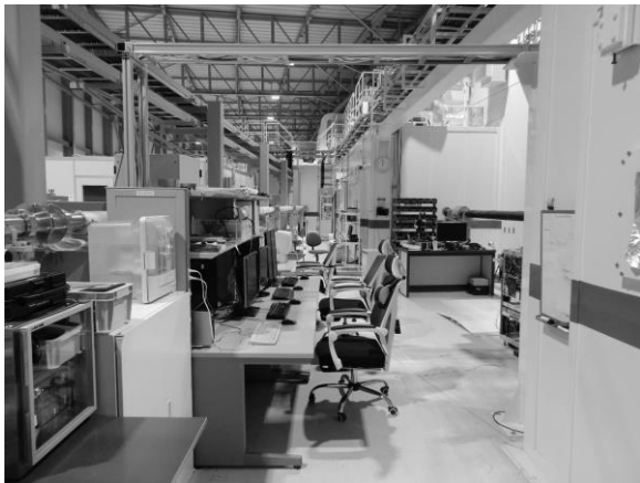
Fig. 2. Appearance of a cable ladder bridge between EH1 and operation console desks.

Cables running across the floor were relocated to a new cable ladder bridge between EH1 and operation console desks. The elimination of