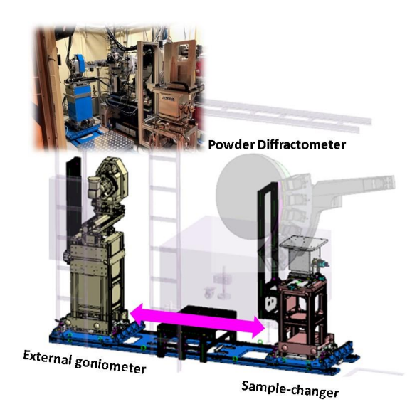
Fig. 2. Picture and schematic drawings of the exchange system.

Shogo Kawaguchi<sup>*1</sup>, Kunihisa Sugimoto<sup>*1</sup>, and Michitaka Takemoto<sup>*2</sup>