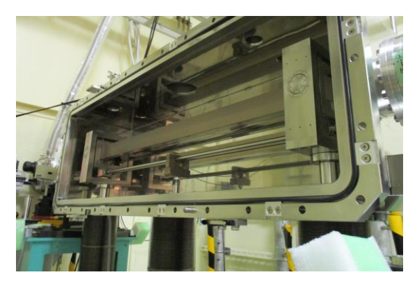
Fig. 4. Ir-coated cylinder mirror of BL40B2 experimental hutch.

focused beam on the sample has been provided since FY2018. However, the upper range of X-ray energy is limited to 9 keV, because the angle of incidence of the mirror with the fixed sagittal curvature must be set to 6.5 mrad due to focus on the sample position.