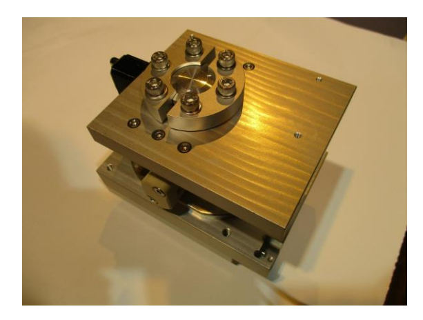
Fig. 2. Chamber of a transfer-and-cleaning system.

Fig. 1. A schematic diagram of sample transfer, cleaning and drying system.