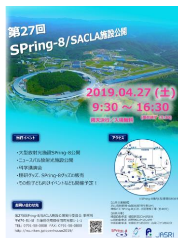
Fig. 1. Open House Poster FY2019

contributions to society. Presentations about the scientific discoveries at SPring-8/SACLA and hands-on experiments with lessons related to synchrotron radiation science were held. We welcomed 2,056 visitors. This number was 20% of that of FY2018 due to inclement weather.