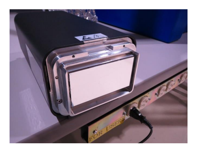
Fig. 2. WAXS detector with newly designed frame and housing.

The WAXS detector was upgraded to have a newly designed frame and housing, as shown in Fig. 2. This allows the image sensor to be exposed outside the frame and the housing of the detector by tilting the detector by 45 degrees. Therefore, in the simultaneous measurements of SAXS and WAXS, missing information between SAXS and WAXS can be reduced, and improved modeling accuracy can be expected.