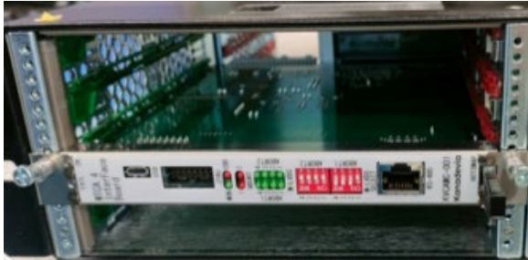
Fig. 3. Photograph of the interface board with MTCA.4 form factor. LEDs display interlock status. DIP SWs (red) select M-LVDS lines. The RJ45 port is used for the RS485 signal.

We developed a device driver for this board on Ubuntu 22.04LST. Figure 3 shows an interface board with an MTCA.4 form factor.