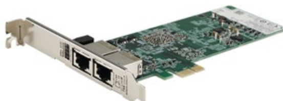
Fig. 2. Photograph of PCI Express board of CC-Link IE Control.

The vacuum system of SPring-8-II will use a programmable logic controller (PLC) with CC-Link IE Control as the network between PLCs. We will use a PC server for equipment control with a PCI Express board of CC-Link IE Control. For this, we developed a device driver for Ubuntu 22.04LTS that allows a PCI Express board of CC-Link IE Control to communicate with the vacuum system (Fig. 2).