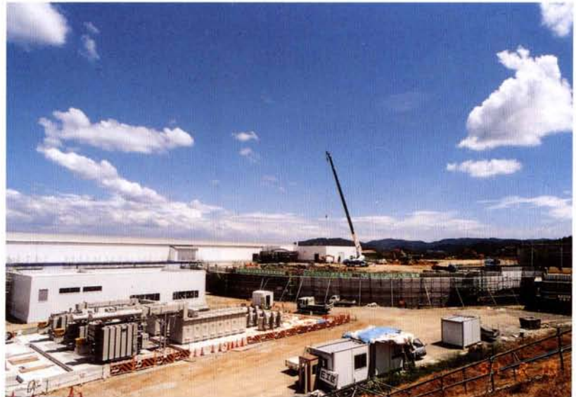
The linac and synchrotron buildings under construction.