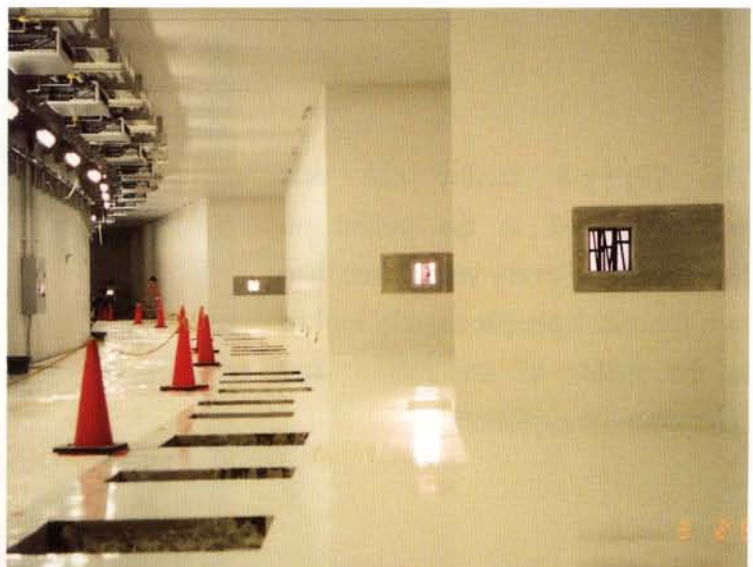
The storage ring tunnel is waiting for the installation of the machine equipments.