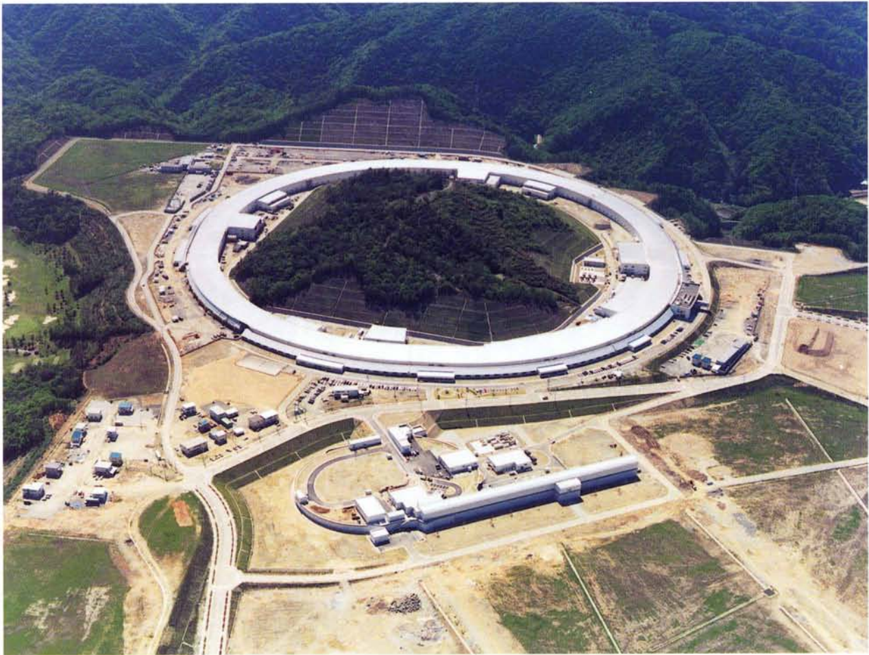
Bird's eye view of the SPring-8 facility in 1995. Construction of the accelerator building for the linac, synchrotron and storage ring was almost completed.