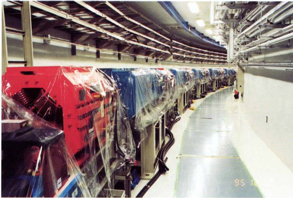
Magnets of the synchrotron were installed in the synchrotron building.