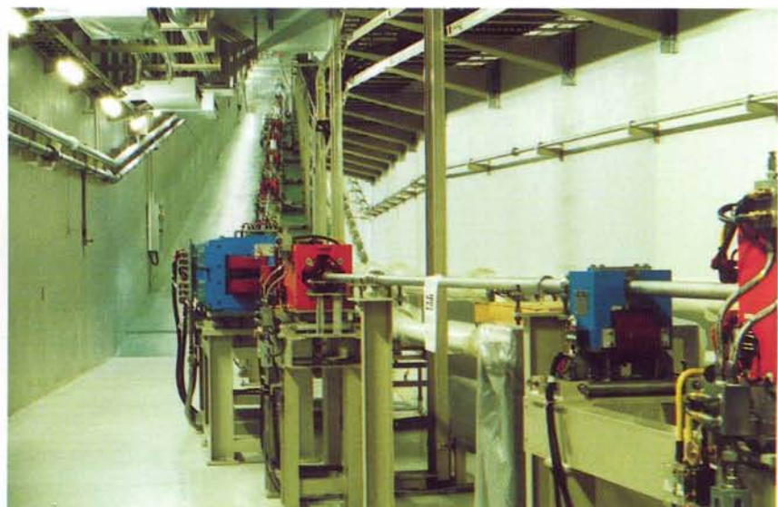
Magnet and vacuum systems were installed in the beam transport line from the synchrotron to the storage ring.