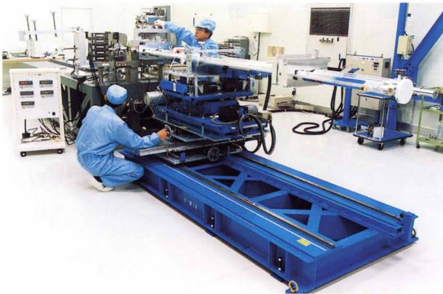
Beam position monitors, fixed to the vacuum chambers for the storage ring, were calibrated by inserting an RF probe in the vacuum chambers.