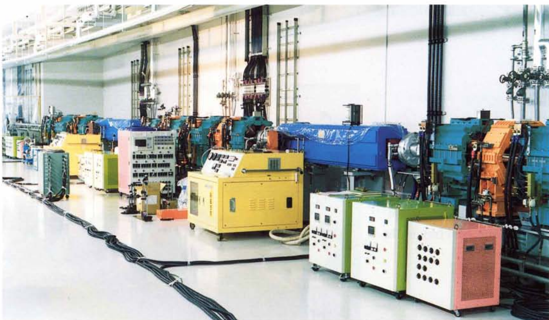
Vacuum chambers installed in the storage ring were baked and pumped using a movable baking and pumping system.