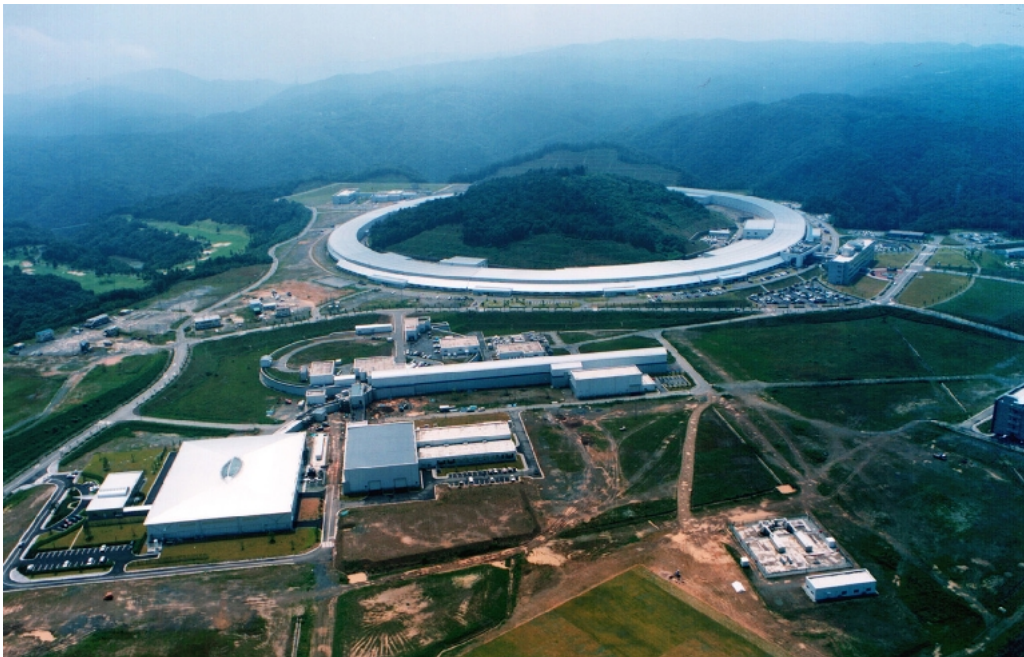
Aerial view of New SUBARU and SPring-8.