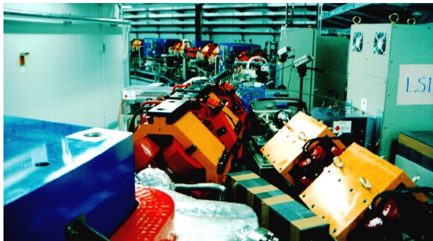
Injection line to the New SUBARU storage ring.