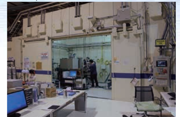
Experimental Station in Experimental Hall Synchrotron radiation from a bending magnet or an insertion device is modified with optics and led to the experimental station. A sample is studied by measuring X-ray scattering/diffraction, X-ray absorption, fluorescence X-rays, secondary electrons, and so on.